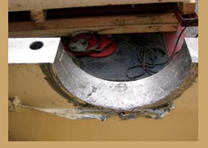
Fig 2. Damaged bearing housing to be repaired by metal spray